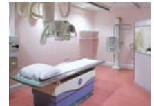
CR General X-ray